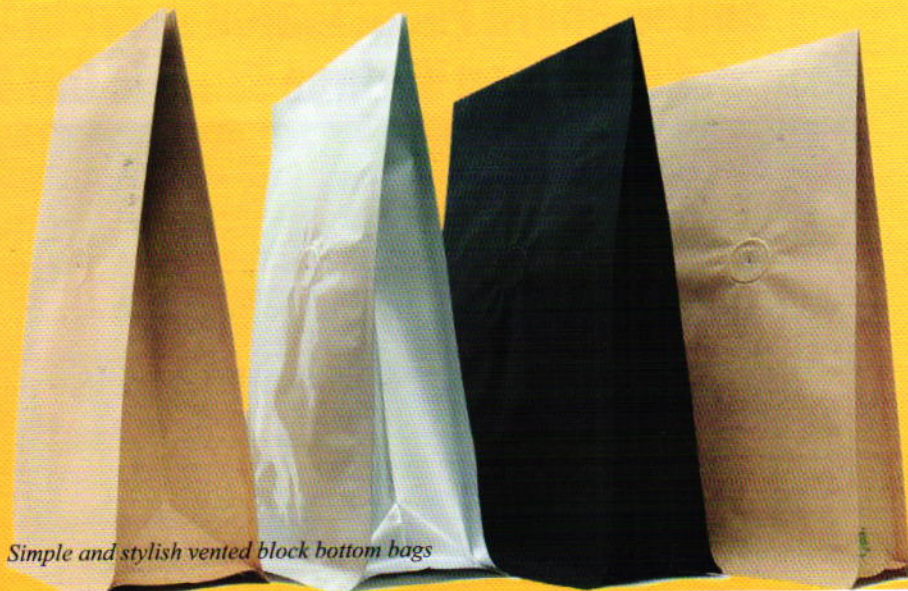
Simple and stylish vented block bottom bags

Looking strictly at color and style, packagers will lean more heavily toward earth tones. Printing will be matte, rather than glossy and the overall effect will be minimalist.