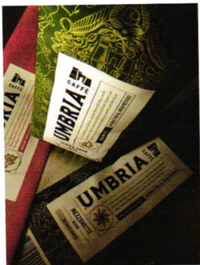
Caffè Umbria Custom Bag 2012

H ow does a company make coffee packaging that stands out among an ever-increasing number of SKUs on the shelf? In the past, the answer was brighter colors, flashy graphics and slick package features. In 2014 there is a change in attitude. Packagers are exploring simple design elements that communicate a more rustic feel and an ongoing commitment to sustainability.