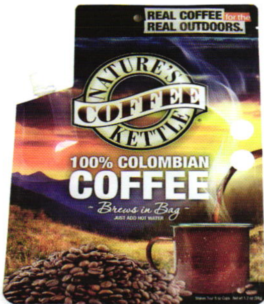
Nature's Coffee Kettle pouch.

Other alternatives which may see increased use in traditional plastics are new oxo-biodegradable additives. EPI Environmental Technologies' Totally Degradable Plastic Additives® are added to resins and can increase the speed of degradation of the plastic when it is exposed to ultraviolet light and high temperatures.